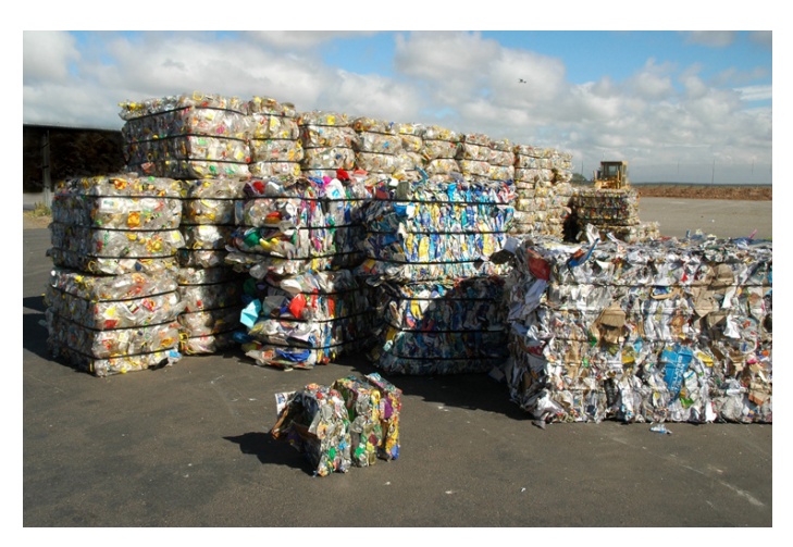
Materials recovered for recycling