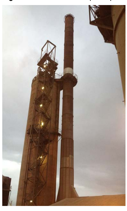
Figure 1: Kiln 4 Main Stack (RP 4A)