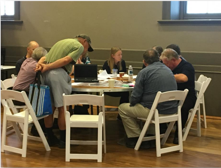
6/2/2017 EPA staff talk to interested members of the community