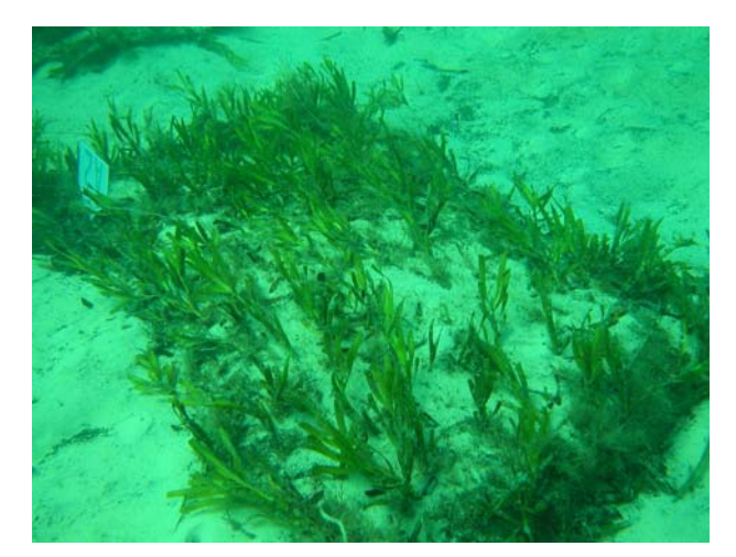
Image 3 Seedlings of Amphibolis antarctica , hooked on to a hessian sand bag

There has been encouraging results recently using a range of different types of hessian substrate which catch naturally released seedlings. The Amphibolis species has a 'grappling hook' found at the base of the seedling which snags on the hessian to hold the seedling in place whilst a root system develops. The most successful method has been a hessian sandbag wrapped in a layer of coarse weave hessian. While there has been much variability in recruitment success using this method in recent years, more than half of the sandbags across all study locations supported some Amphibolis after 12 months. Although successful, this method is not a universal remedy. Seagrass restoration will require a range of methods, targeting different species, in conjunction with the appropriate management of inputs to the coastal environment.