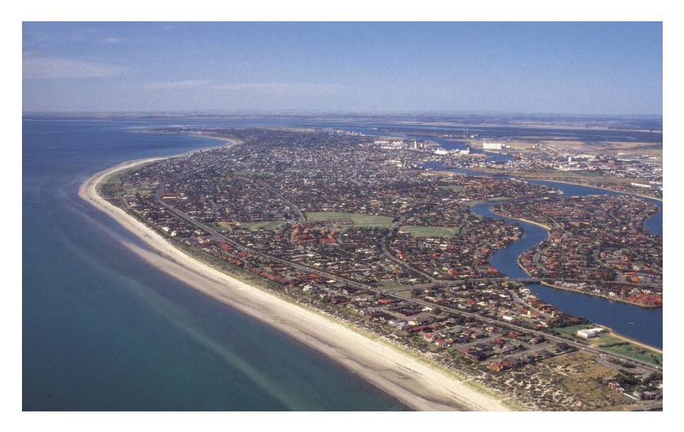
Adelaide metropolitan coastline.

Small changes in the way we manage our households are a cheap and simple way to help improve the health of Adelaide's coastal waters. Other actions which require more money are supported by initiatives such as the South Australian Government's H<sub>2</sub>OME Rebate scheme which provides financial incentives for those improving the water efficiency of their home. Improving the water efficiency of your home not only saves water but reduces the volume sent to wastewater treatment plants and stormwater systems, ultimately reducing the volume of water discharged to the coast.