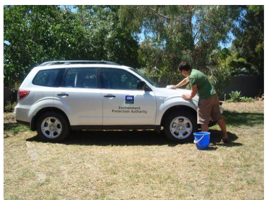
Washing car on grass