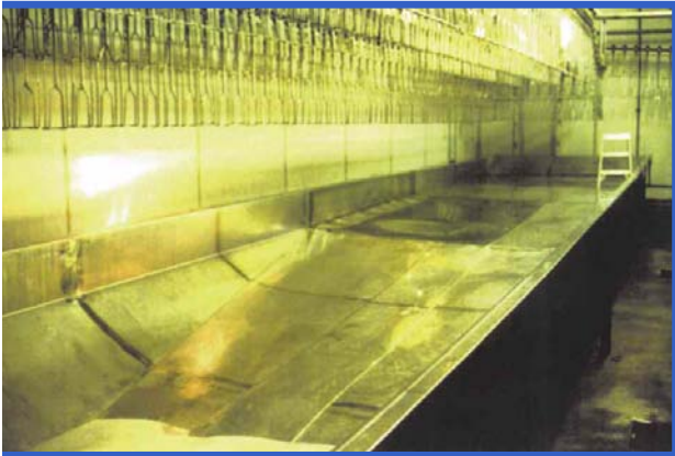
> Large blood collection tray