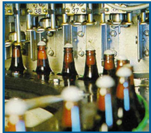
> Beer filling line

Waste can be easily reduced by calibrating filling apparatus, ensuring fill detectors are working properly and working to standard operating procedures.