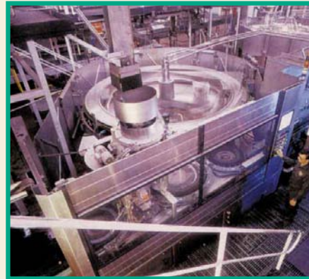
> A rotary filling machine

THE SOUTH AUSTRALIAN BREWING COMPANY PTY LTD