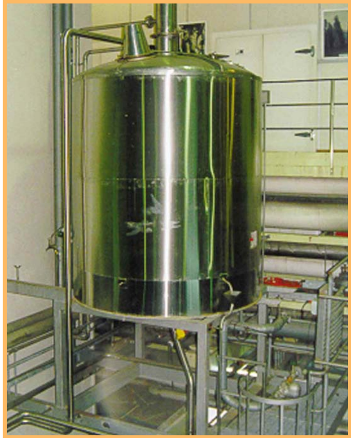
> Trub extraction storage tank

THE SOUTH AUSTRALIAN BREWING COMPANY PTY LTD