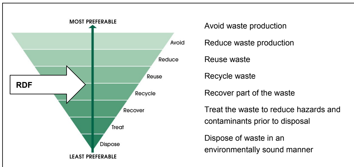
Figure 2 RDF and the waste hierarchy

South Australia’s Waste Strategy 2005–2010 sets the overall framework and aims for sustainable waste management in the state. It aims for the diversion of waste, in accordance with the waste hierarchy (Figure 2), to more sustainable options. This means that the production and combustion of RDF, which is viewed as a recovery of energy activity, should be an alternative to disposal (the least preferable option) but should not be at the expense of more preferable options, including waste avoidance or closed loop recycling. However, RDF should only be used where it is safe and sustainable to do so. This standard therefore describes the requirements for demonstrating the suitability of RDF.