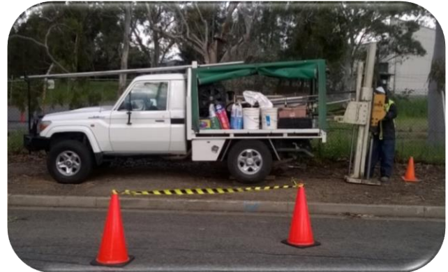
A soil vapour bore being drilled on a road verge

The soil vapour bores will be installed using smaller 4WD vehicles with drills mounted on the back. You can expect to see small teams of 2 to 3 people drilling each bore. Team members will be wearing standard safety equipment including high visibility clothing, steel cap boots, safety glasses and gloves.