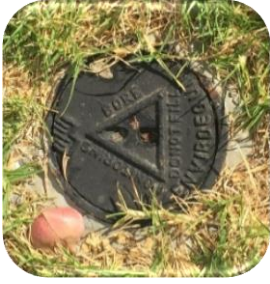
Small caps are placed over permanent sampling locations

The planned assessment works will include installation of approximately: