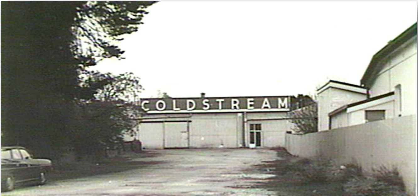
Coldstream Refrigeration premises – photo courtesy State Library of South Australia, photographed by Ron Praise 1984

The Environment Protection Authority (EPA) is undertaking environmental works in Unley, in an assessment area bounded by Charles Lane, Little Charles Street, Mary Street and Tyne Place.