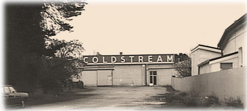
Coldstream Refrigeration premises - photo courtesy State Library of South Australia, photographed by Ron Praitte 1984

Historical land uses in the Unley assessment area include refrigeration manufacturing, furniture manufacturing, cabinet making, boot making and a drapery.