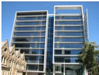
Above: New VS1 building in Victoria Square