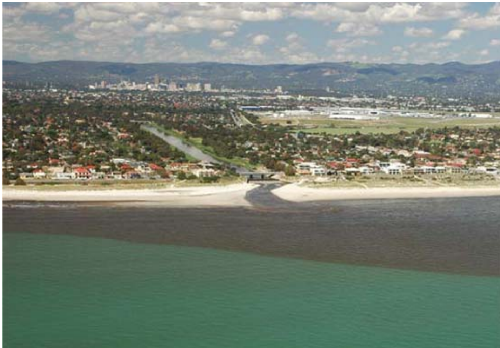
Image 1 Major discharge of stormwater from the Torrens River into Adelaide's coastal waters on 25 October 2005

Large volumes of freshwater, nutrients, suspended sediments and other pollutants have been introduced to Adelaide's nearshore waters from urban and rural runoff, wastewater treatment plants (WWTPs) and some industrial sources. These inputs have resulted in reduced water quality with increased nutrients and turbidity. Findings from the Adelaide Coastal Waters Study (ACWS) indicate that nutrient rich and turbid inputs to Adelaide's coastal waters are the main causes for the loss of seagrass along the Adelaide coastline. High levels of suspended sediments transported by stormwater inflows to Adelaide's nearshore waters are responsible for impaired recreational water quality following high rainfall events.