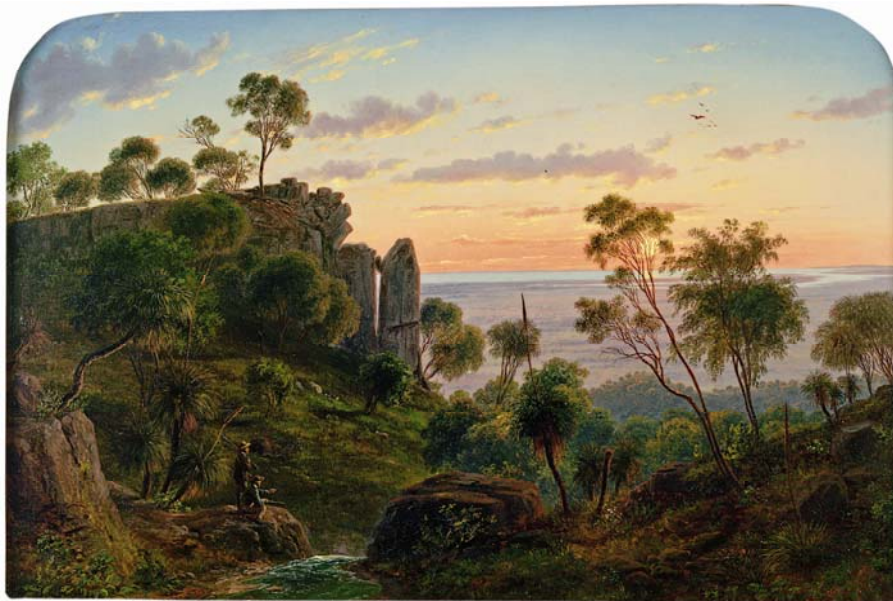
Image 2 Scenery in the Mount Lofty Ranges, near Adelaide, and a View of the Gulf of St Vincent, South Australia

Prior to European settlement, loads of nutrients and sediments to coastal waters would have been minimal. This is because South Australia has soils naturally low in nutrients and areas formerly covered in native vegetation would have acted as a natural filter as runoff passed through. Flows would have been characteristically high in coloured organic material.